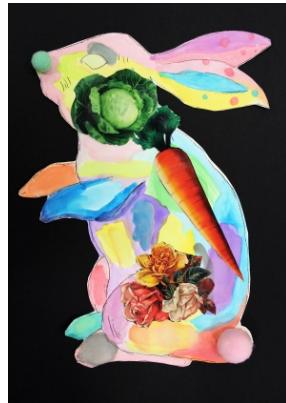
Mixed media rabbit by Sarah New Understanding