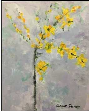
Forsythia by Dave Louisa, KY Side by Side 2017