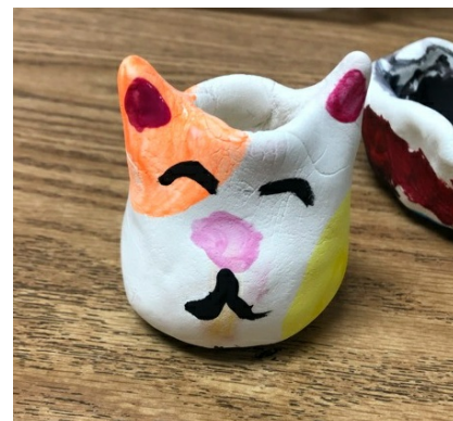
"Pinch Pots and More" at Poage Elementary School

Lewis County Central Elementary Barbourville Independent South Todd Elementary Clay County High School Mt. Vernon Elementary Bell County High School Ohio County Middle School Potter Gray Elementary Bowen Elementary Cumberland County Elementary