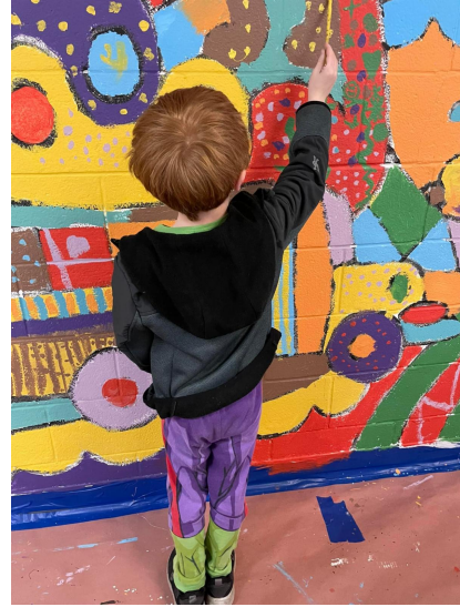
Mural painting at South Todd Elementary School

Arts for All Kentucky can provide $1350 to your school for an inclusive, hands-on program in creative writing, dance, drama, storytelling, music, or visual art. Activities can be in-person, virtual, or as hybrid projects.