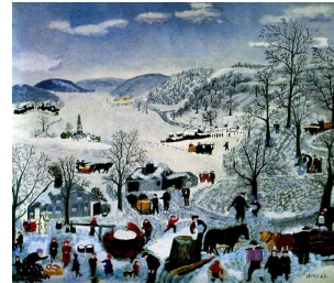
Sugaring Off by Grandma Moses, 1943

Check out our Facebook page for ARTSHARE, mini lessons in art appreciation, featuring a variety of artists, styles, eras, and techniques. Be sure to share your thoughts, artwork, and photos in the comments.