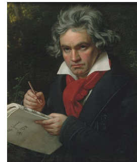
Ludwig van Beethoven by Joseph Steiler

Stay informed, Follow and Like Arts for All Kentucky on Facebook !