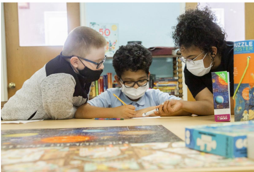
Kentucky Shakespeare provided summer programming at Backside Learning Center in Louisville.