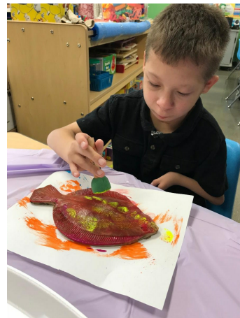
Gyotaku fish printing at Jennings Creek Elementary's summer program in Bowling Green.